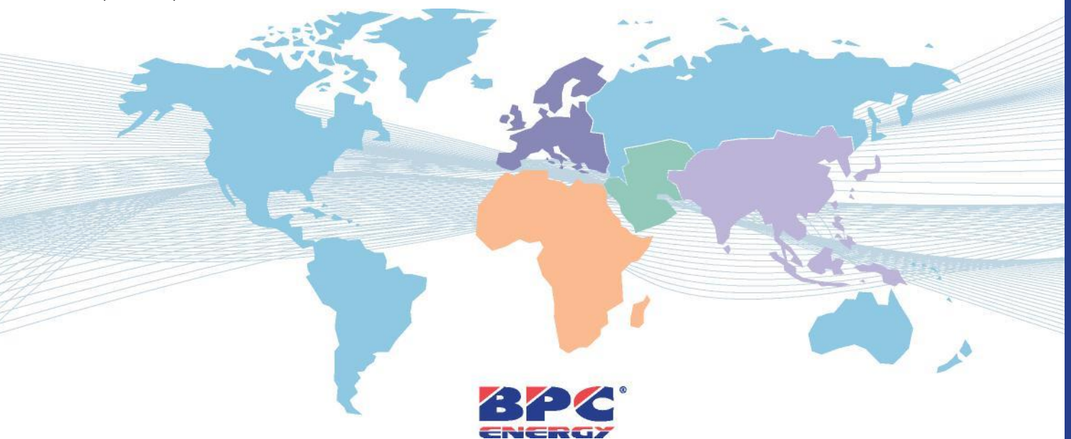
The British Power Conversion Company

To ensure a high level of pre and post-sales support is offered, BPC work closely with distributors, providing key commercial and technical training whilst providing competitive costing structures tailored to specific region markets, ensuring the most suitable BPC products are offered. We pride ourselves on long standing relationships with our partners which is reflected in the ongoing support provided locally.